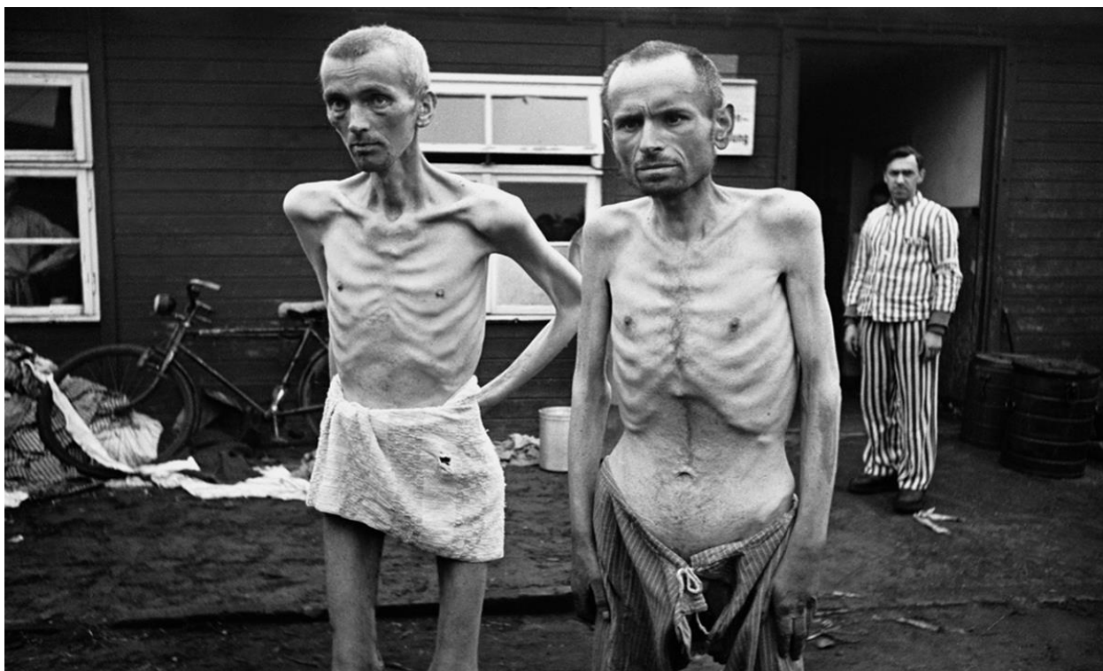
Photo by A. Shaikhet. Freed prisoners of the concentration camp. 1945. https://russiainphoto.ru/exhibitions/727/#36

The study notes the superficial knowledge of the Nazi era among the population of Germany. It concludes that the significant gaps in knowledge are linked to a lack of readiness and willingness to engage in its critical reflection. Forty-two percent of respondents emphasized the importance of preserving the memory of Nazi crimes. Almost as many respondents (38 per cent) believe that it is time to "draw a line" under the era of National Socialism. At the same time, 43.6 per cent of those surveyed think it is "better to devote oneself to current issues" rather than studying the events of the past.