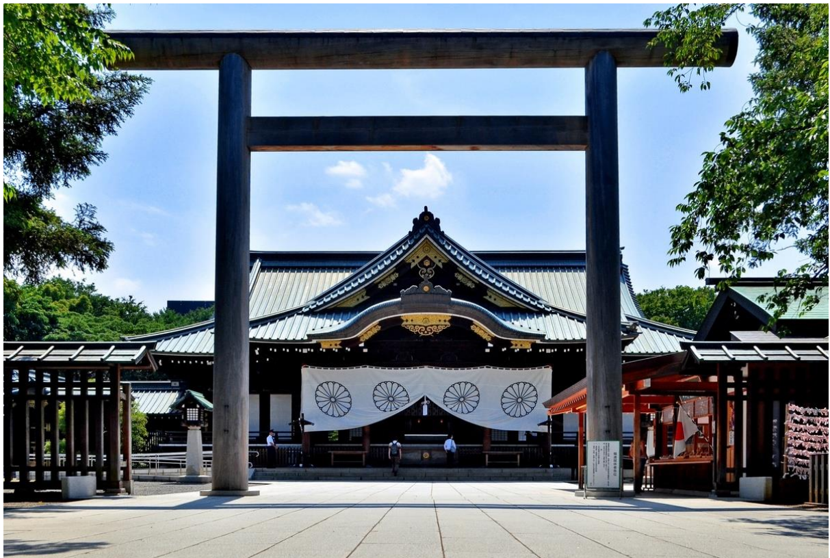
Yasukuni Shrine

As acknowledged by Japanese experts, these forces have succeeded in promoting the idea of revising the restrictions imposed on the country after WWII: Through consistent efforts, Shinto conservatives restored the era-based chronology system tied to the reigns the emperors, some of the traditional national holidays of the pre-war period, in particular the birthday of Emperor Hirohito, under whose reign Japan had forged an alliance with Nazi Germany and unleashed a war in the Pacific Ocean.