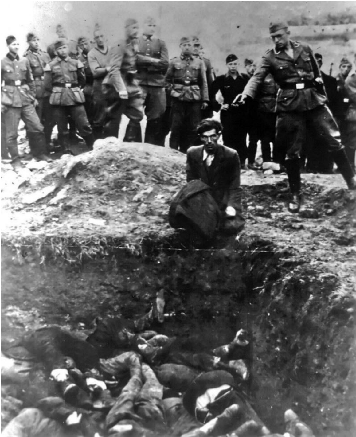
A Ukrainian Jew being shot by a German soldier during a mass execution of local residents in Vinnitsa, Ukraine, approximately between 1941 and 1943. This photograph, titled "The Last Jew in Vinnitsa" (this was the exact inscription on the back of the photograph), was found in a photo album belonging to a German soldier.

https://fishki.net/anti/91762-vtoraja-mirovaja-vojna-holokost-45-foto.html