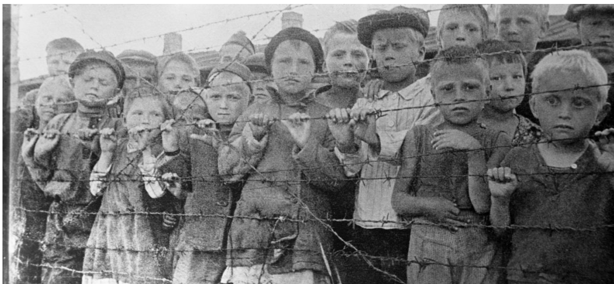
Children who were prisoners of the Nazi concentration camp Majdanek. Their blood was taken for transfusions to wounded German officers.