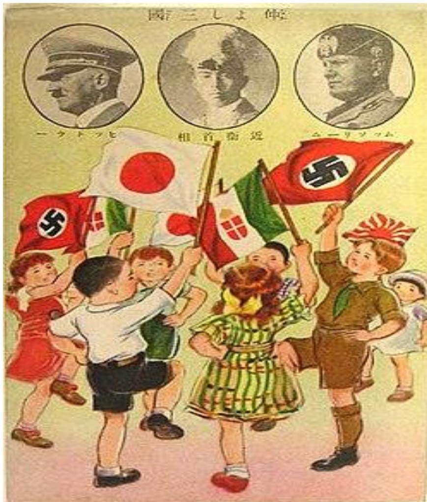
Japanese poster dedicated to the signing of the Tripartite Pact 2

History repeats itself, and the patterns developed in Nazi Germany, fascist Italy and militaristic Japan find application these days. Attempts are being made to reform public consciousness, erase historical memory, inter alia, among younger generations, support and legalize neopagan and satanist movements, oppose canonical Orthodoxy, etc.