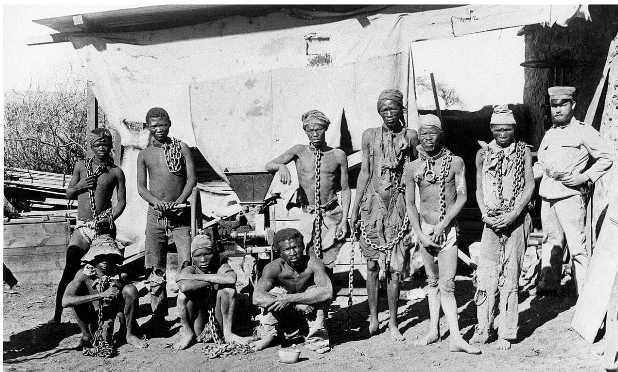
Prisoners of the Herero and Nama tribes during the genocide.

officers against members of ethnic minorities. According to CERD, Germany should legislatively ban racial profiling and establish an independent mechanism to address complaints regarding it. 149