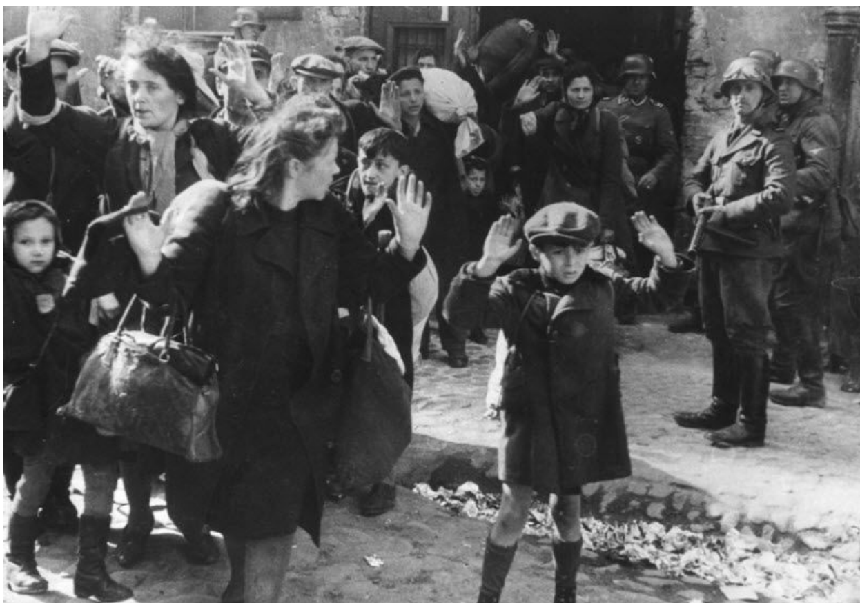
A group of Jews, including a young boy, is being led out of the Warsaw Ghetto under the escort of German soldiers. The photograph was taken on 19 April 1943. It was part of a report by SS General Jürgen Stroop to his command and was presented as evidence of Nazi atrocities during the Nuremberg Trials in 1945.

https://fishki.net/anti/91762-vtoraja-mirovaja-vojna-holokost-45-foto.html